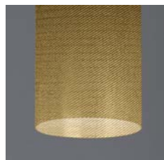
Special Gold Edition (G)